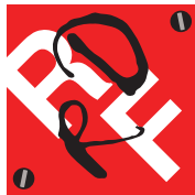
ROAD DANGER REDUCTION FORUM