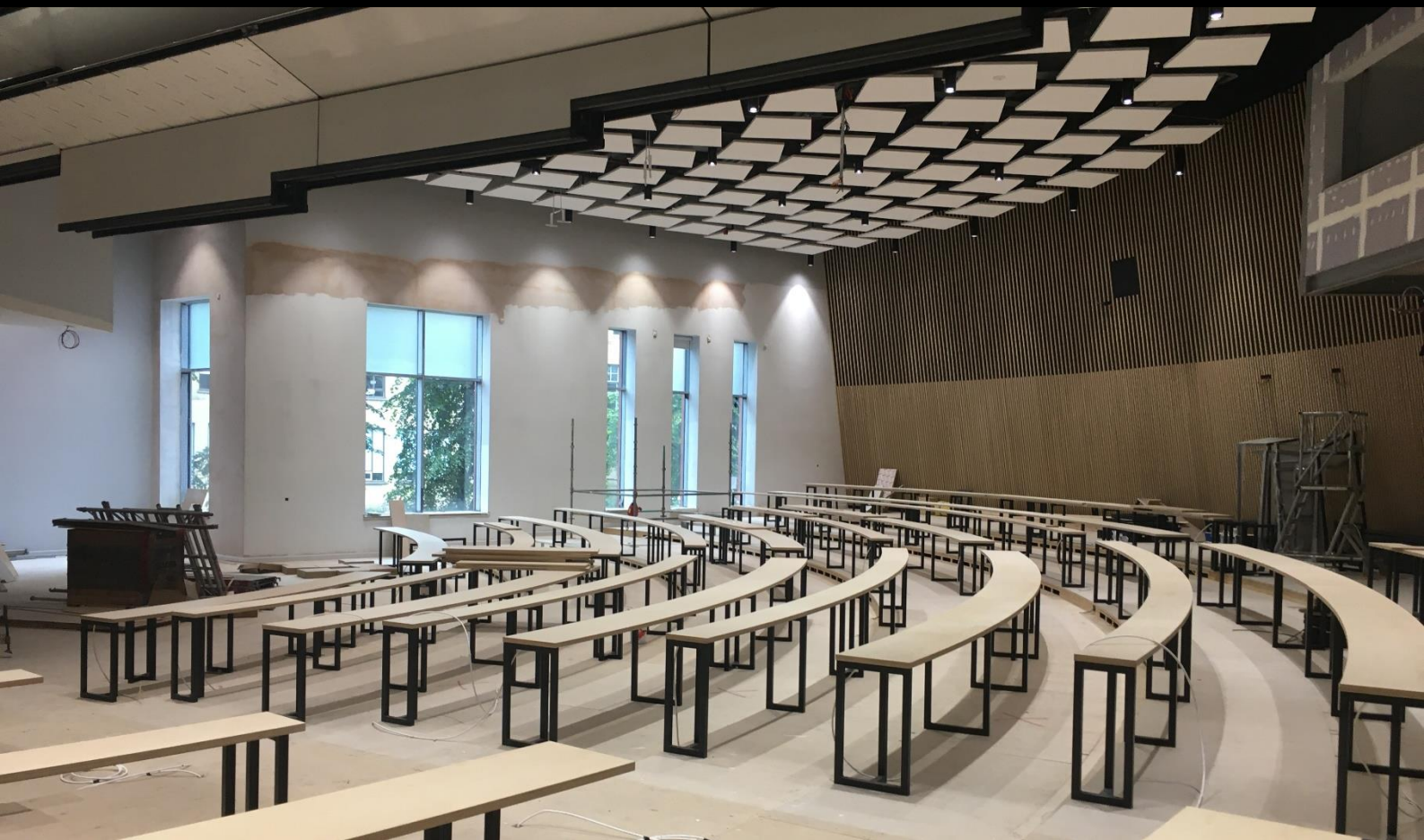
James McCune Smith Learning Hub – Main Lecture Theatre