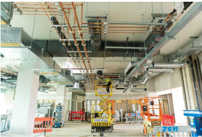
Research Hub services installation