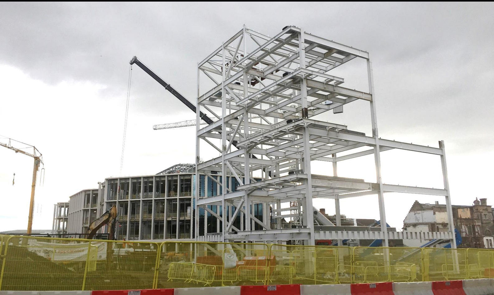
Installation of the Clarice Pears Institute of Health & Wellbeing Steel Frame