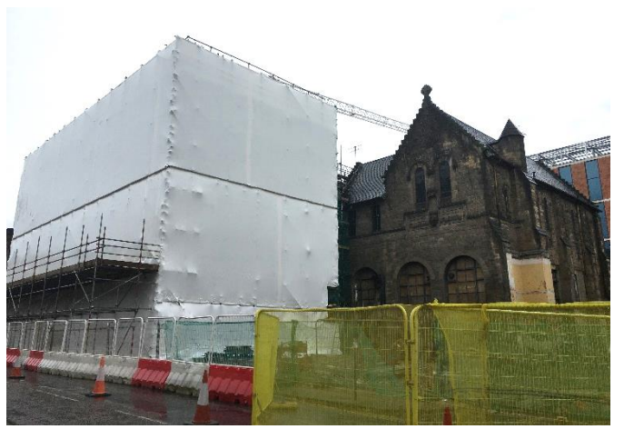
Gardiner Institute wrapped for demolition