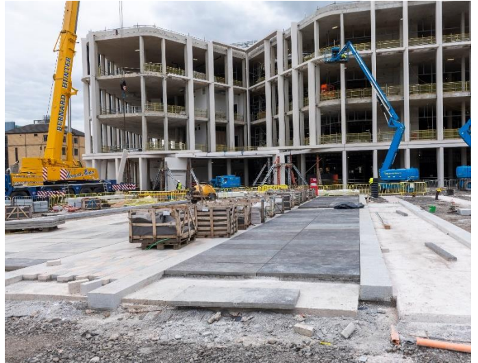
Public realm works outside the Research Hub