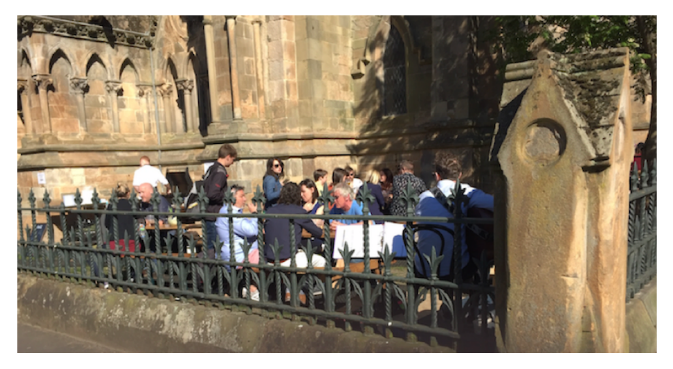
Websters - A Vibrant Location in Summer 2019

A public space at this end of the bridge over the Kelvin in front of a fine public building would be a link in the chain of high quality tourism features that span the River Kelvin Walkway from the Clyde all the way to the Botanic Gardens and beyond. A chance for visitors and local people using the river for recreation to pause and enjoy the ambience of the St George's Cross/Great Western Road Local Town Centre facilities.