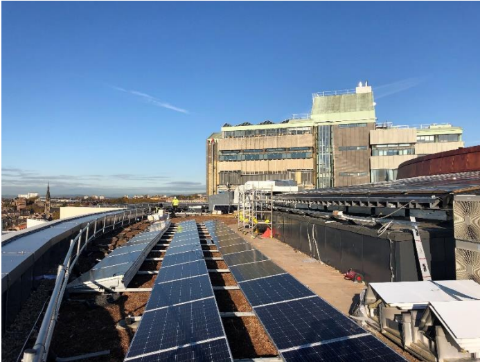
Solar Panel installation on the James McCune Smith Learning Hub roof