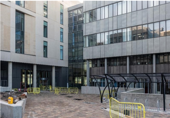
There will be increased bike storage facilities next to the Boyd Orr Building and Hetherington House.