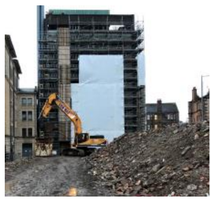
Pontecorvo Building wrapped ahead of demolition