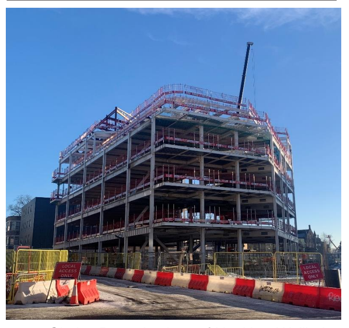
Clarice Pears Institute of Health & Wellbeing