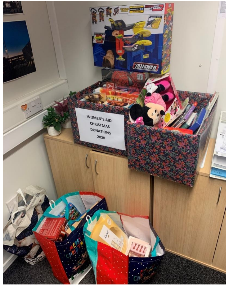
Glasgow Women's Aid has been supporting women, children and young people who are experiencing domestic abuse for over 35 years, providing information, support and temporary refuge accommodation.

Over 100 presents were kindly donated by the project team and supply chain including children's toys and perfume sets.