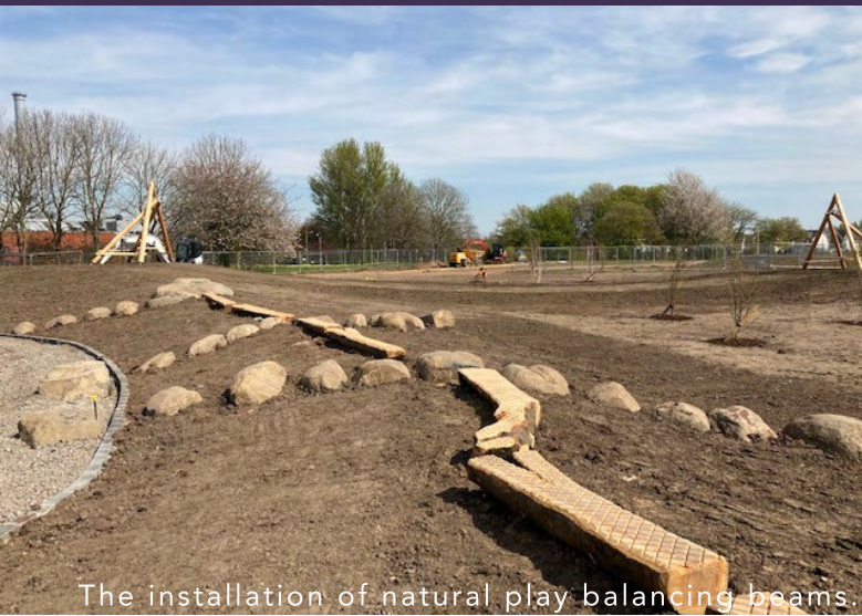
The installation of natural play balancing beams.