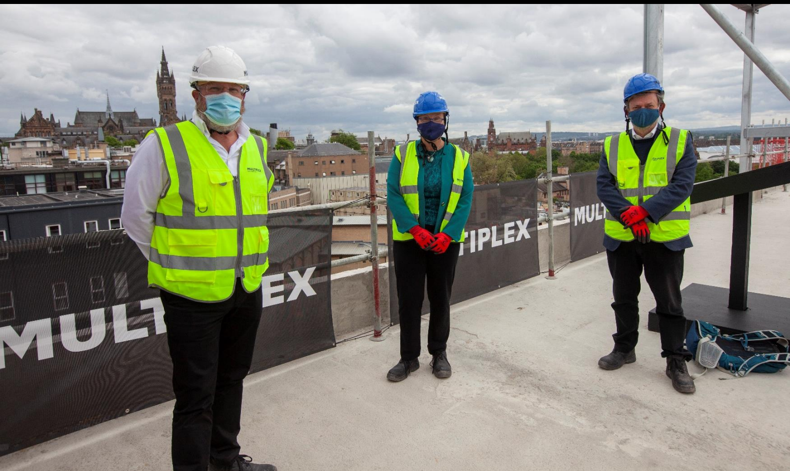
The Clarice Pears building Topping Out Ceremony, June 2021