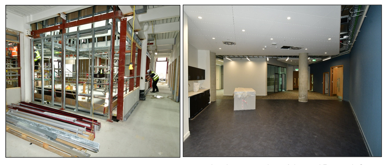
Interior progression – Clarice Pears Level 5